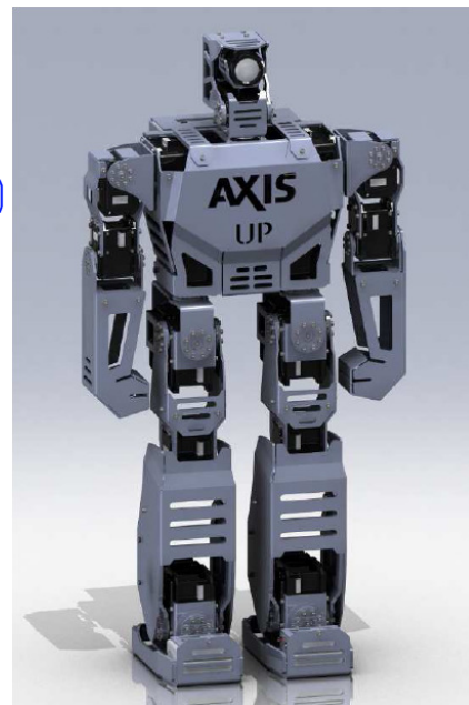
(b) Structural design