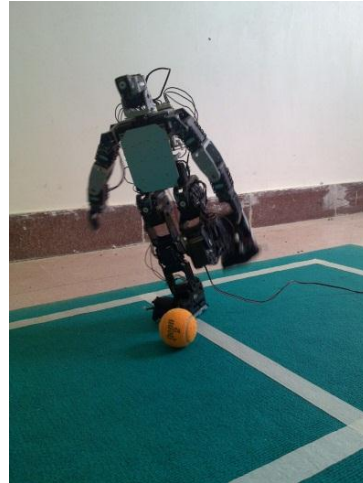
UURT Humanoid KidSize Robot kicking a ball with kinematical robot structure.