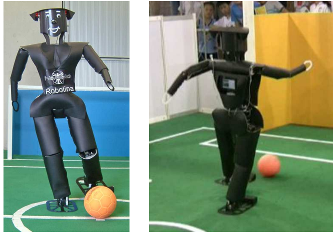
Fig. 2. NimbRo TeenSize robot Robotina.